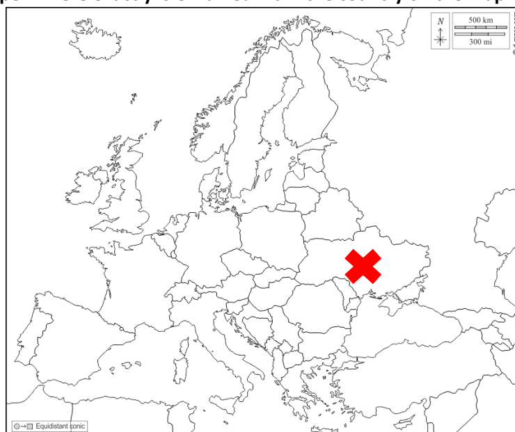
(map adapted from https://d-maps.com )