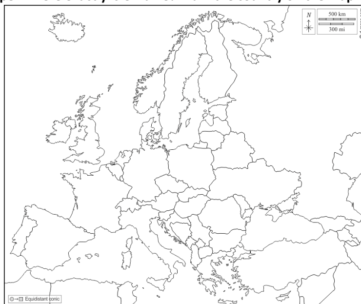
(map adapted from https://d-maps.com )