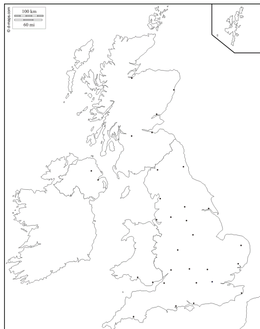
(map adapted from https://d-maps.com )

Try to find the dot which represents Oxford. Work alone or with your deskmate.