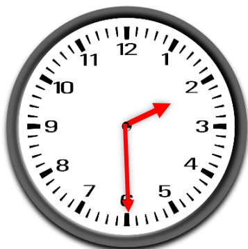
clipart adapted from https://openclipart.org/detail/217092/blank-clock