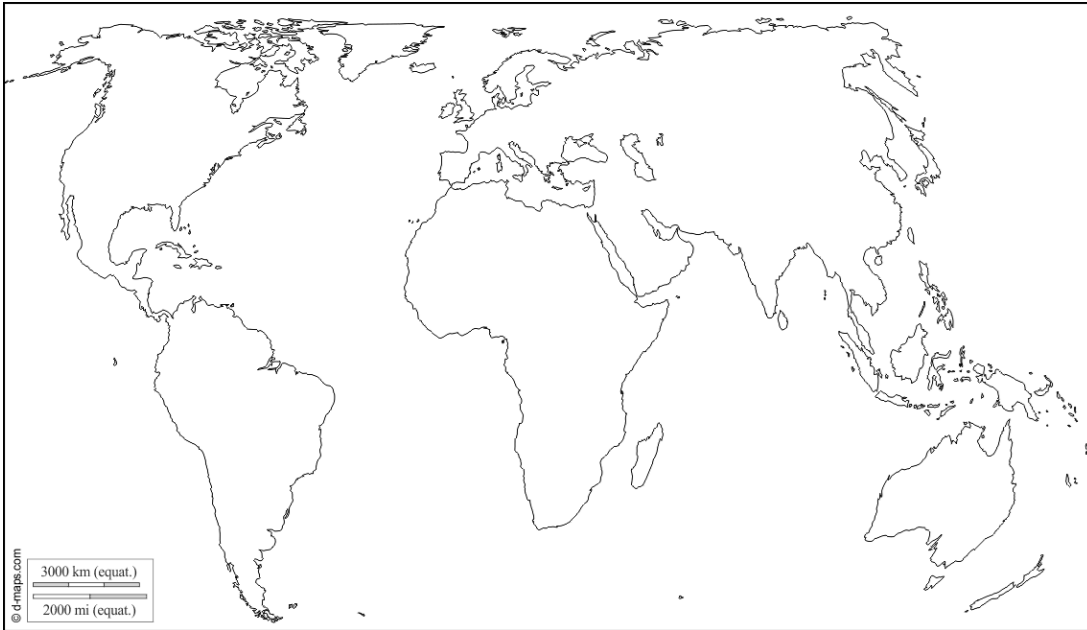
(map adapted from https://d-maps.com )

3 Where did the first democracy start? Mark the appropriate region on the provided world map.