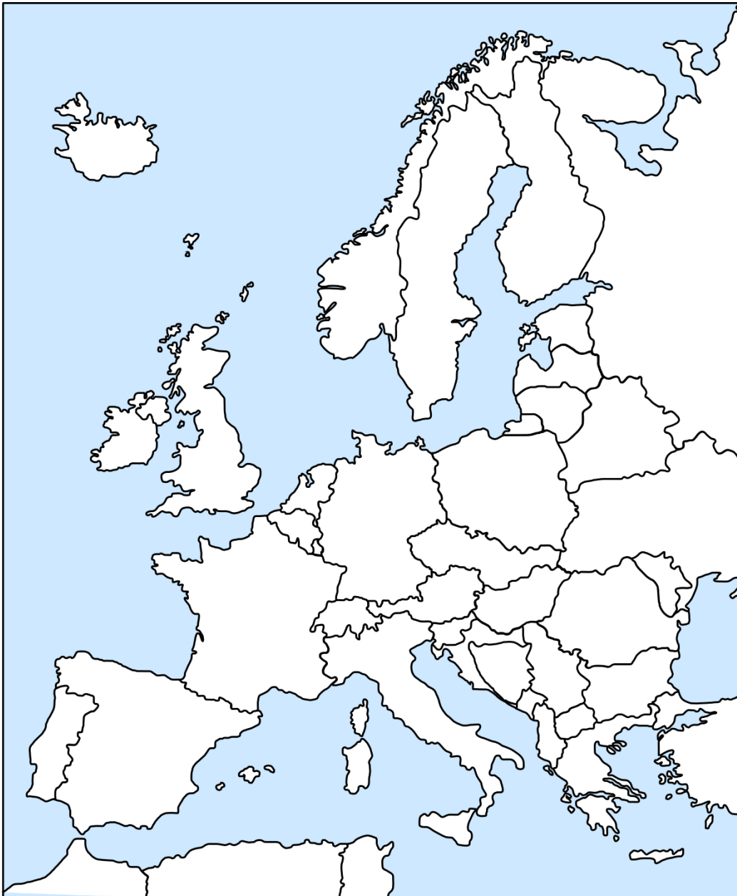
(map adapted from https://openclipart.org/detail/6734/europe-outline )